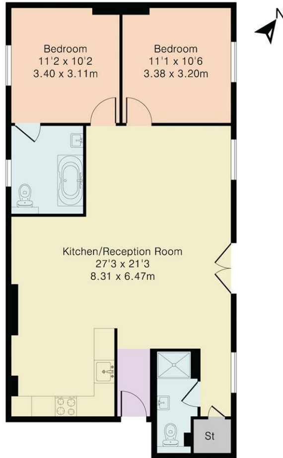
Second Floor Flat

Approximate Gross Internal Area 865 sq ft – 80 sq m